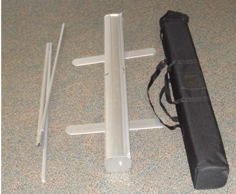
Exhibit Parts (retractor display base, support poles, storage carrying case)

No, the exhibit weighs 9 lbs and measures 3'w x 6.5'h. The kit includes retractor display base, exhibit graphic display and is housed in its own carry case. It sets up in seconds.